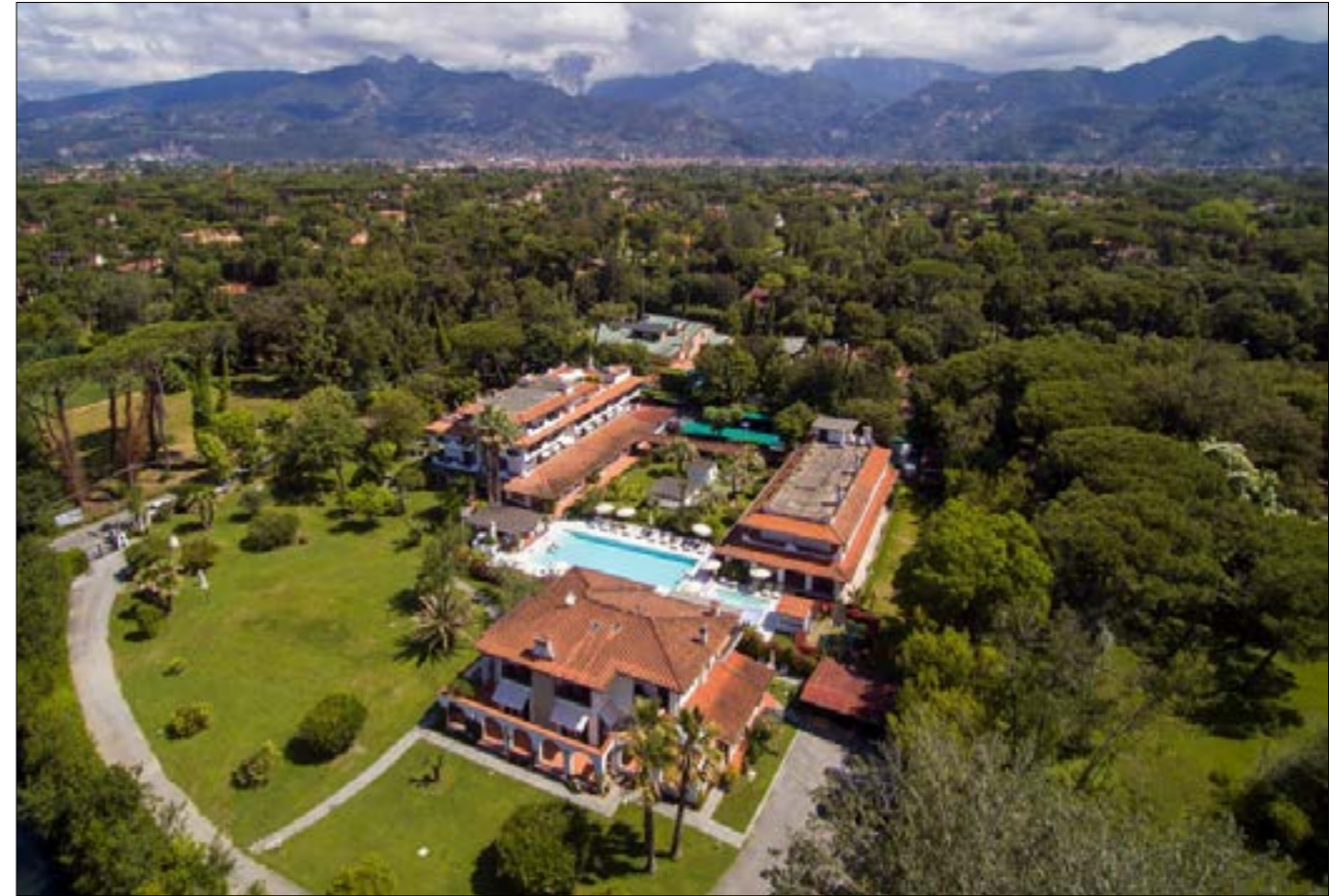
The California Park Hotel located in a natural park, very close to the seafront.

Forte dei Marmi (LU), 9th-13th of May 2024